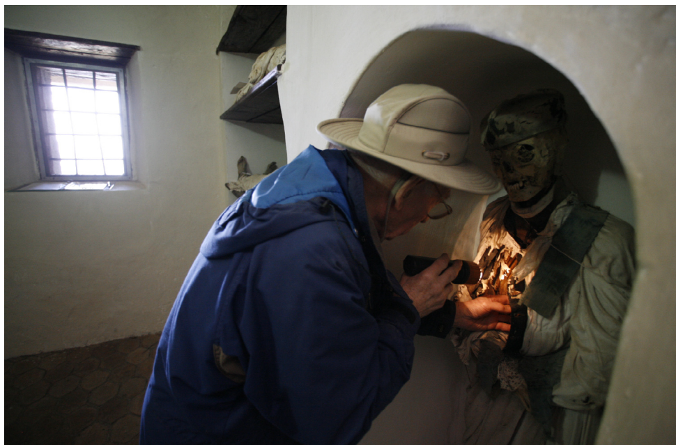
Fig. 2. Professor Aufderheide inspecting one of the mummies in the crypt of the Mother Church of Piraino.

2003). Another important aspect of relevance for Sicilian mummy studies was the definition of these findings as “spontaneous-enhanced”, meaning obtained through natural desiccation. This was done by using the related preparation rooms located in the crypts, but also by filling the cavities with foreign material through areas where there was loss of substance (Piombino-Mascali, 2018). The second collection was that of Novara di Sicilia, in the Nebrodi mountains, where six mummies are held in the Mother Church’s subterranean chamber. In this picturesque town we speculated on the importance of the environmental conditions conducive to the mummification process, as suggested by the presence of some dead cats that had been mummified after being trapped in the crypt. Soon after, we headed to the historic town of Piraino, located on a hill overlooking the Tyrrhenian Sea (Figs 2-4). There, the pristine condition of many of the 26 remains seen in the crypt enabled Aufderheide to observe some pathological features, such as pleural adhesions on a mummy and the presence of a coprolite (Nystrom & Piombino-Mascali, 2017). The final mummy set to be inspected was in the Capuchin Cata-