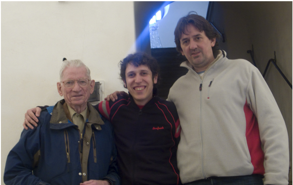
Fig. 1. The three members of the scientific expedition in the crypt of the Mother Church of Savoca.