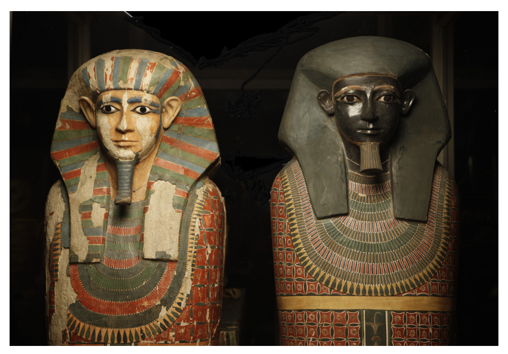
Fig. 1. The 'Two Brothers' inner 'body' coffins – Khnum-nakht on left and Nakht-ankh on the right.

The burial was unearthed by an Egyptian workman under the supervision of British Egyptologists, Flinders Petrie and Ernest Mackay. The complete contents of the find, including their coffins and grave goods, were later transferred to Manchester Museum in 1908, and remained intact as a group rather than being divided among different museum collections, as was usual at that time (David 1979: I and 2007).