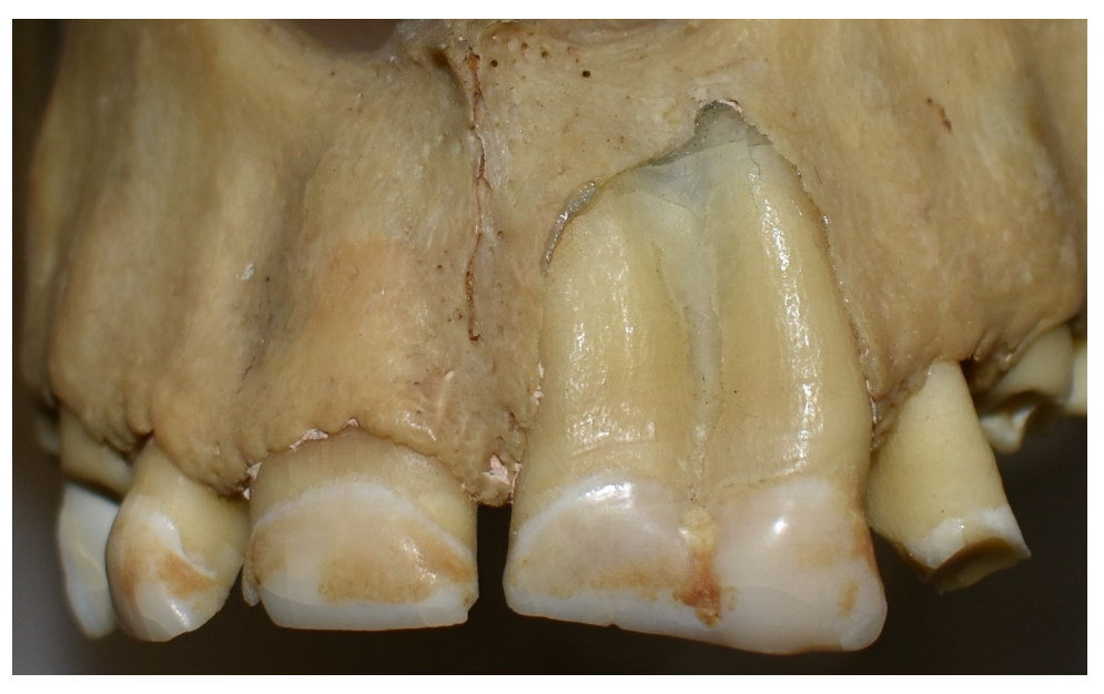
Fig. 4. Maxillary anterior teeth of Khnum-nakht. The central incisors display the rare developmental abnormality of fusion (left) and gemination (right) within the same arch.