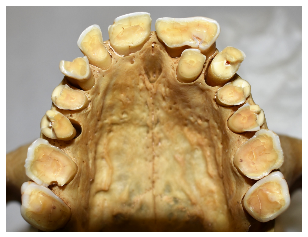
Fig. 3. Teeth of Khnum-nakht showing extensive tooth wear.