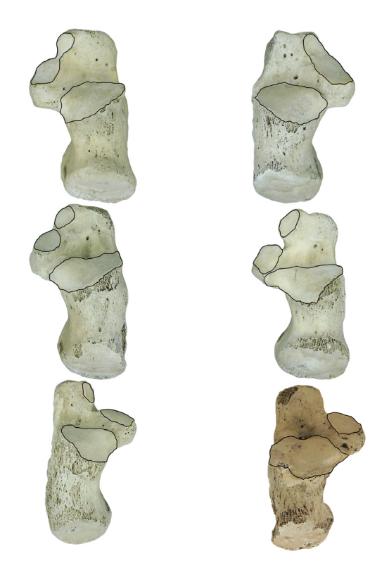
Fig. 3. Calcaneal facets included in this study. Type Ia: Fused anterior facets constricted type (top left). Type Ib: Fused anterior facets non-constricted type (top right). Type IIa: Triple facets: <5mm between facets (middle left). Type IIb: Triple facets: 5-10mm between facets (bottom left). Type III: Absence of anterior facet (bottom right).

able in the literature. However, during the chi-square tests, we decided to group together all types as present or absent as previous authors have done (Yilmaz and Baykara 2008). This was in order to avoid diluting the general number of Os Trigonum in La Concepción population. (Fig. 2).